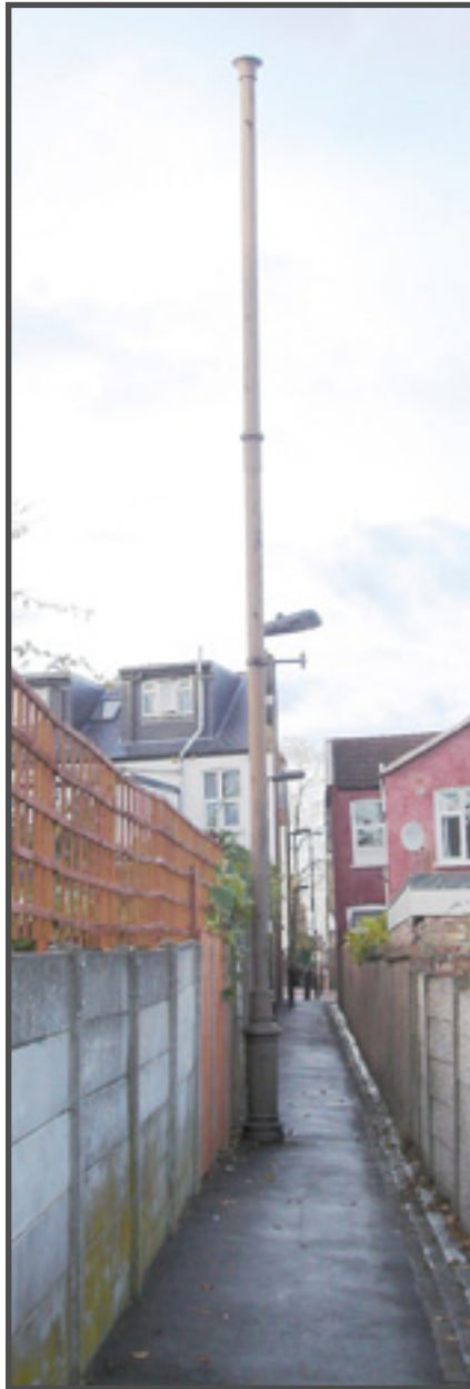
Fig. 2 (John Hinshelwood, 2007)