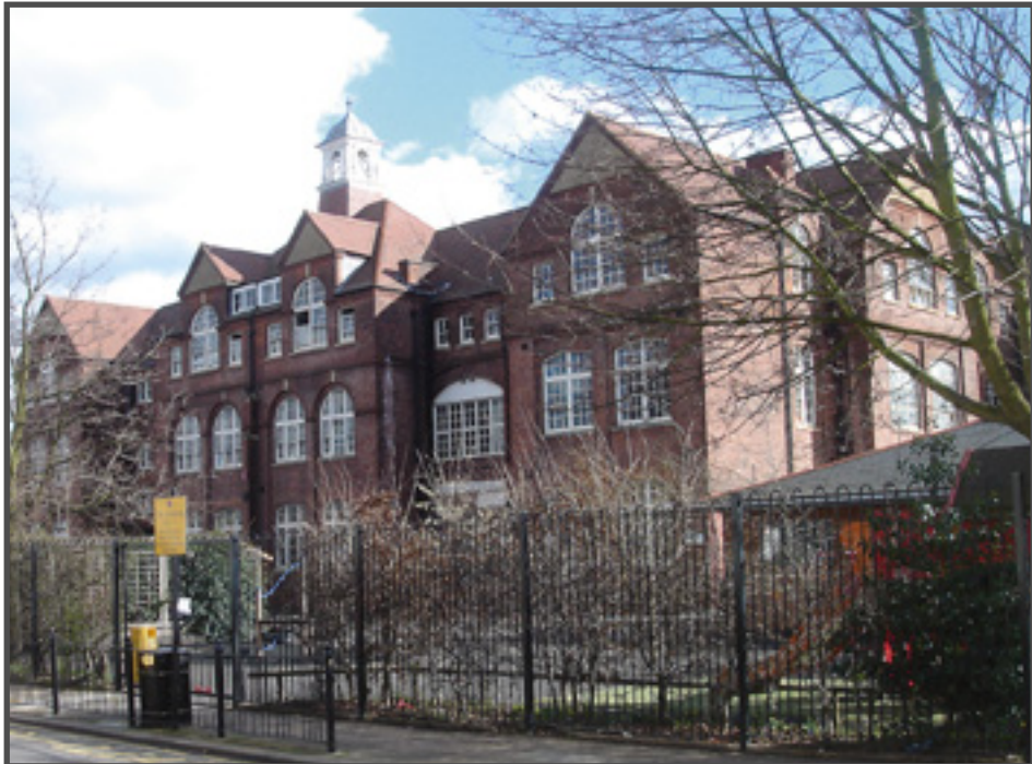
Fig. 1

The Haringey Passage provides a safe walking route above the sewer between the houses on the Ladder. This is particularly valuable for children attending the two schools.