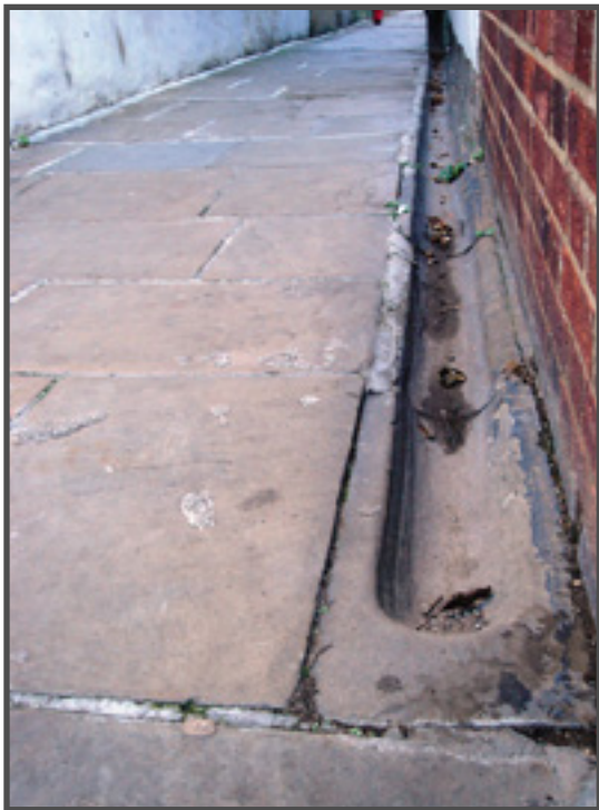
Fig. 1 (John Hinshelwood, 2007)

In the 1870s, the Hornsey Outfall Sewer was built across the parkland of Harringay House. The Harringay Passage marks the line of this sewer.