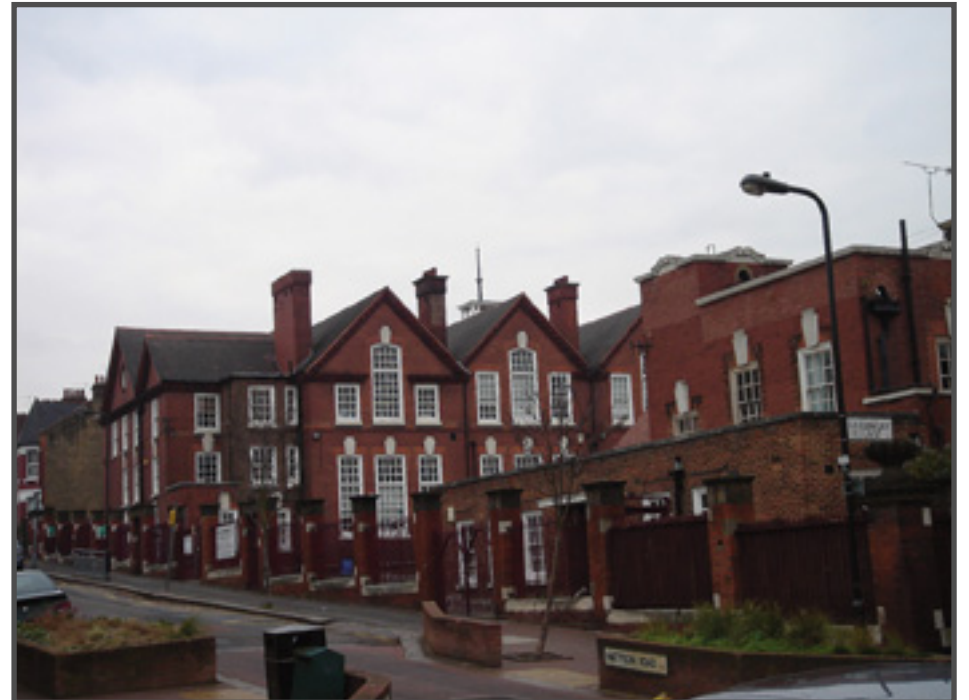
Fig. 2 (John Hinshelwood, 2007)

Harringay Board School, opened in 1893 (Fig. 1). From 1903 it was called North Harringay School and it was reorganised as a junior and infants school in 1934.