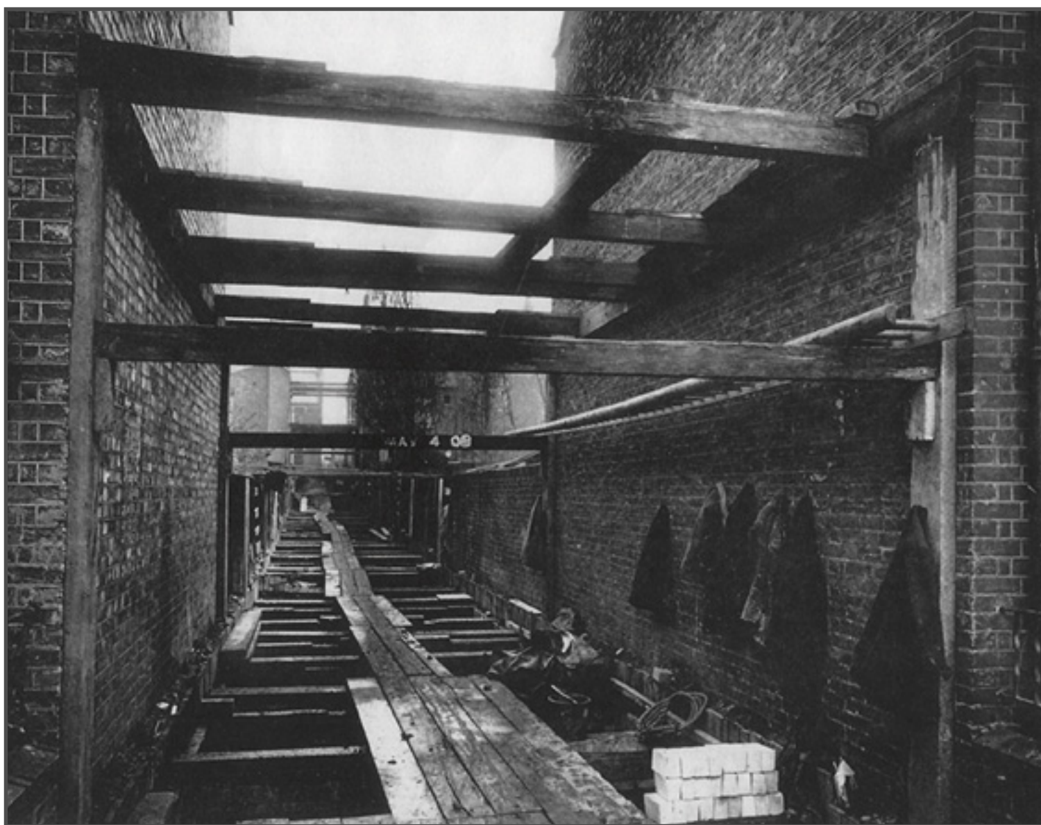
Up-grading works to the sewers, Fairfax Road, 1903.

When Harringay Park was sold off and Harringay House pulled down the Ladder streets were laid out in their place. As the houses were built the space over the Hornsey Outfall Sewer became a footpath. Paving the first part of the passage started in 1887-8. The second section was paved in 1889-90.