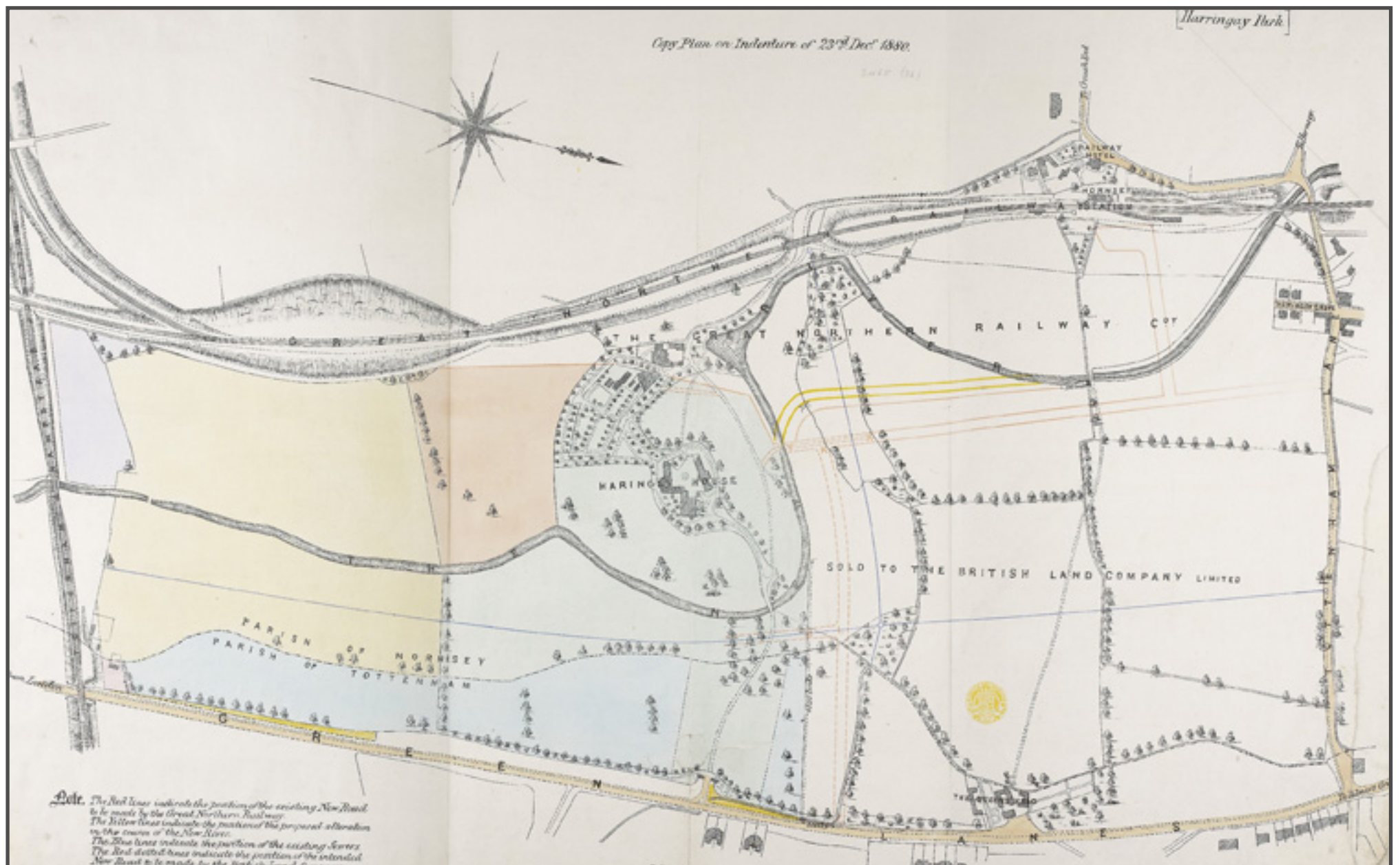
Harringay Park as it was in 1880s.

The Harringay Ladder was built across land that was once the estate of Harringay House, which stood at the summit of the hill between Allison and Hewitt roads. In 1880 the estate was open land with a sewer (shown by the blue line) and the new River running through it. Before the sewer was built, Hornsey had to pay Tottenham to dispose of its sewage in the river Lea.