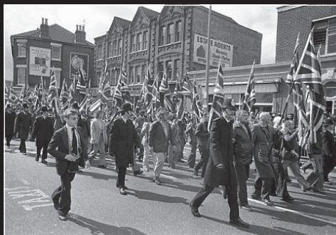
NF fascists marching along Turnpike Lane

Join our community celebration on 23rd April and get involved!