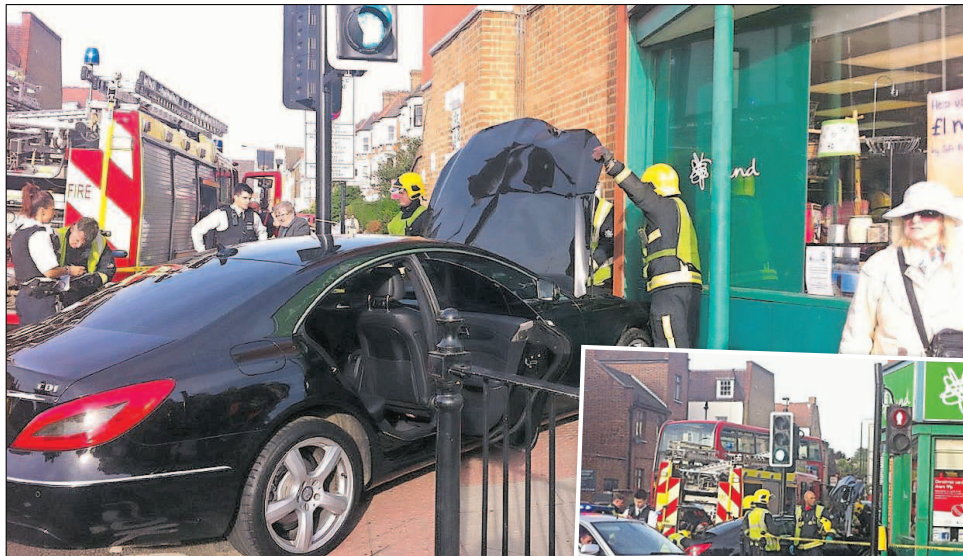
■ The aftermath of Tuesday's crash

"He was outside and about to cross the road. He had just left the