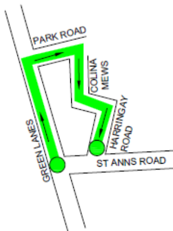
Green Lanes to Harringay Road Northbound Diversion Route