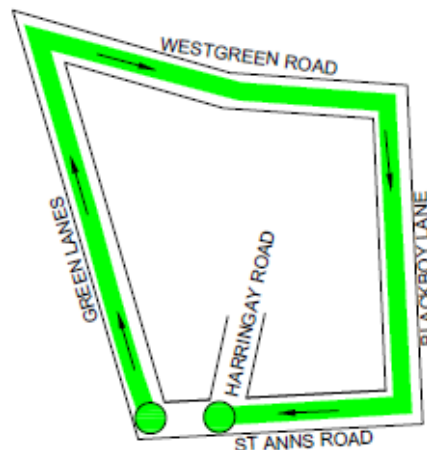
Green Lanes - St Anns Road Northbound Diversion Route

Diversion Routes 28th, 29 th and 30th July between the hours of 9.30pm-5.00pm