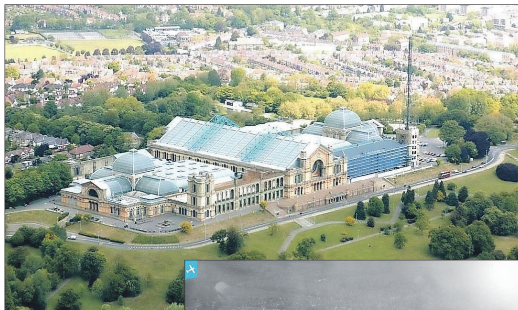
■ Alexandra Palace today, above, and in 1921, right

And if that isn't enough, there will also be a farmers market, a trackless train, pedalo races, roaming performers and – excitingly – a tethered balloon which will take visitors up into the sky for a bird's eye look at one of the best views in London.