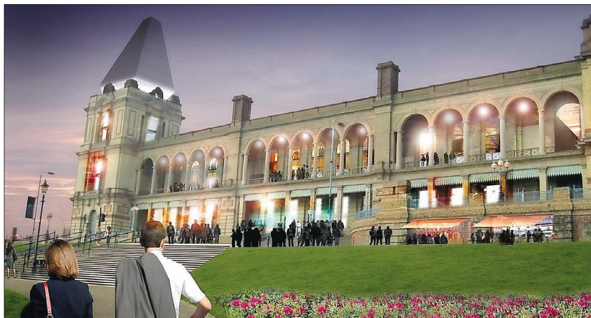
■ The hotel would sit behind the west facade

CELEBRATING 28 YEARS IN N10 CELEBRATING 28 YEARS IN N10