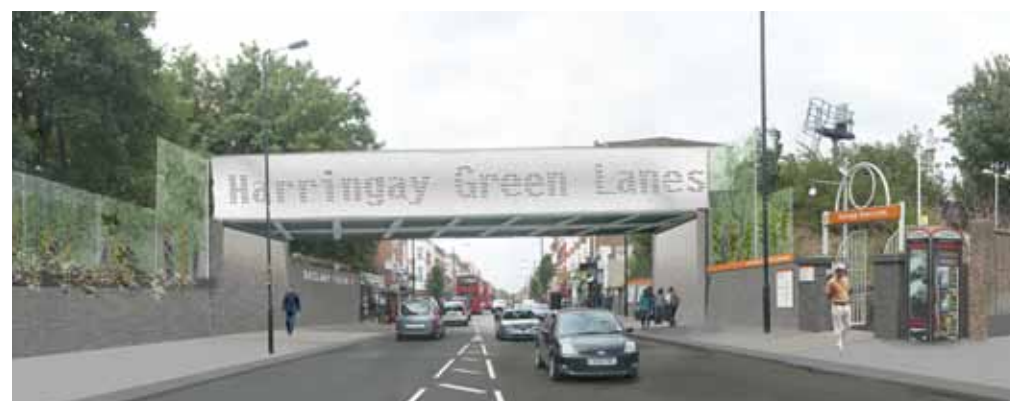
Option B: New banner, with 'cats eyes' reflectors spelling place name. These could be placed at one or both sides of the bridge face. Steel mesh also used at sides, with plants growing up from long hanging baskets. New footway surfaces and lighting. Station access is indicated unchanged