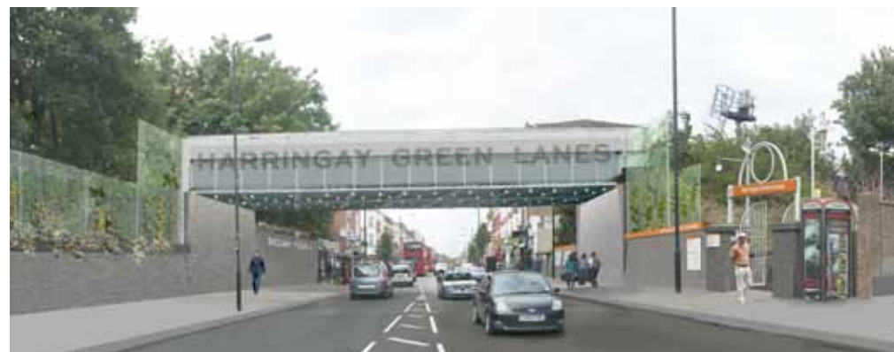
Option A: Steel mesh screening fixed to the bridge with 'cats-eyes' reflectors spelling the place name. Mesh would be spaced away from the bridge to deter graffiti. Sign indicating Railway Fields. Steel mesh also used at sides of bridge, with plants growing up from long hanging baskets. New footway surfaces and lighting. Station access is indicated as unchanged

Note: All options shown here are subject to agreement with the railway operator. Some of the various measures proposed in each option can be used in various combinations, subject to available