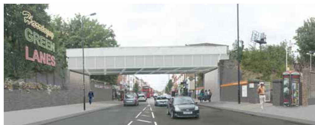
Option C: Painted bridge and improved lighting. A new high visibility neon sign is located at the side of the railside embankment. This image indicates a decluttered station entrance environment which would be subject to future agreement with the railway operator and available funding