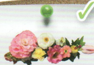
Flowers and plants (no soil)