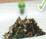
Leaves and prunings