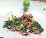
Grass cuttings and hedge clippings