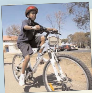
Money will go towards cycling lessons