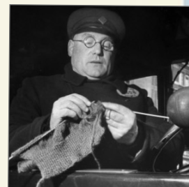
Knit one, purl one