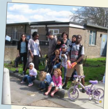
Our community growers